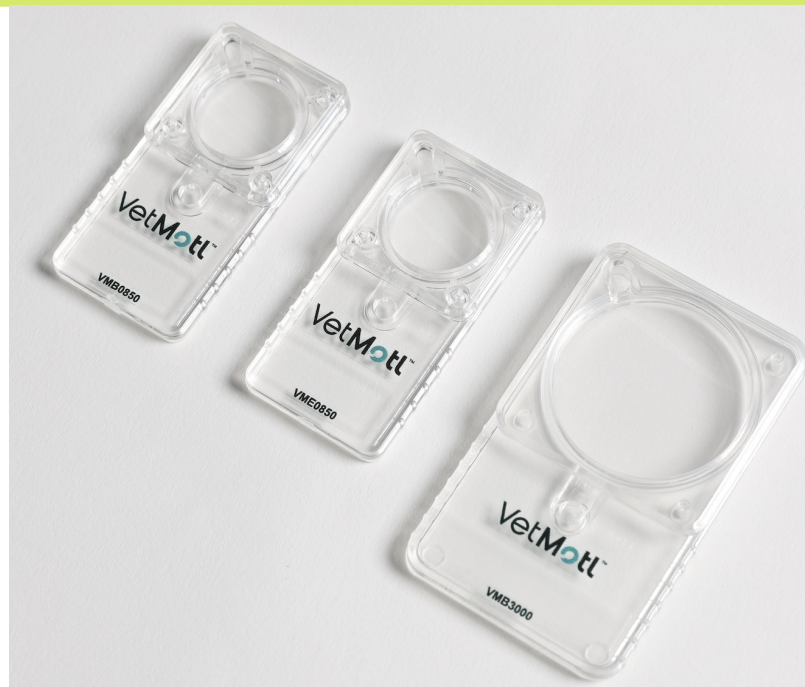
VMB0850 (850µl) and VMB03000 (3ml)

Our devices have been commercialized for use in human fertility clinics as ZyMōt® Sperm Separation devices since 2015.